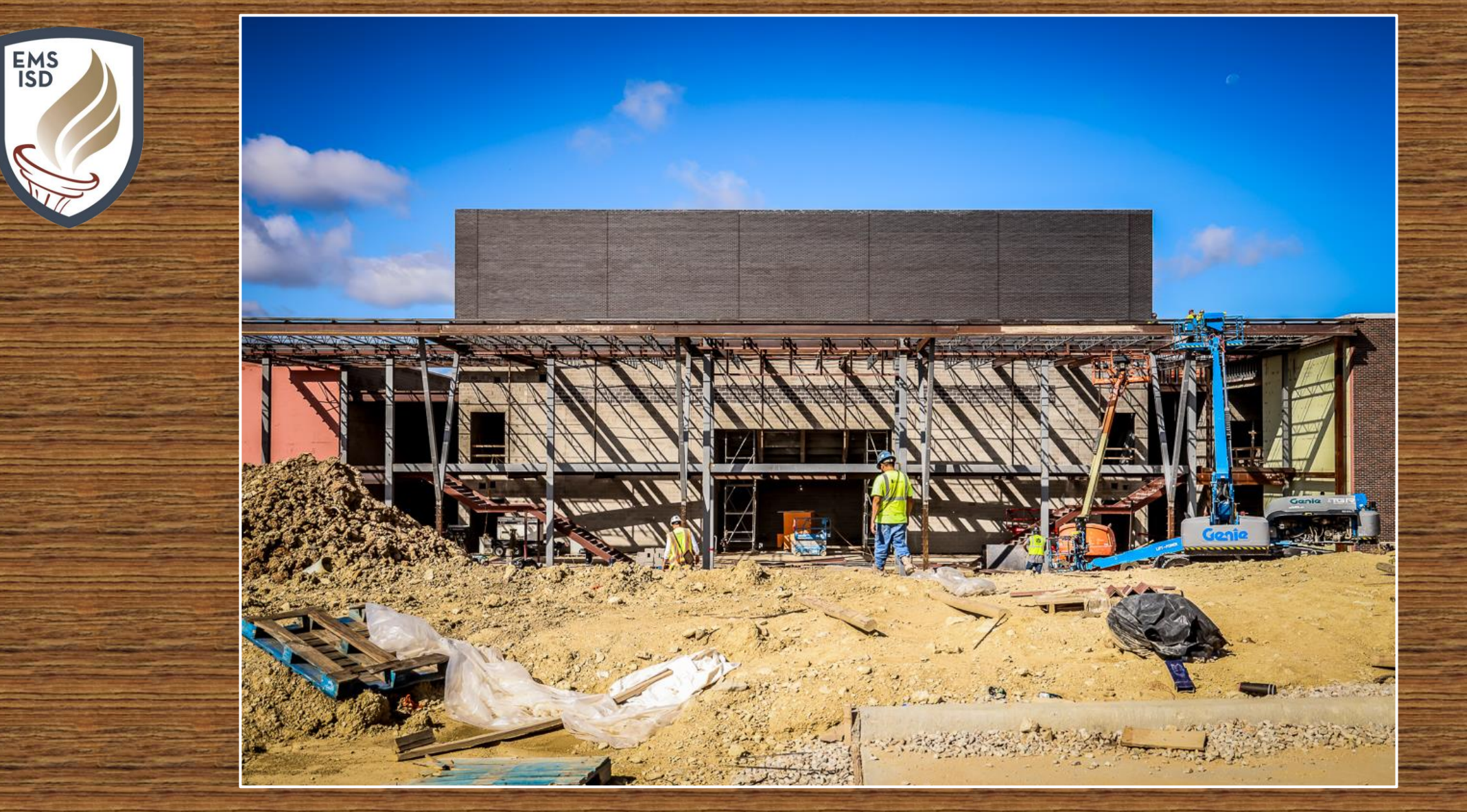
Structural steel installation on the main entrance to the PAC is in progress.